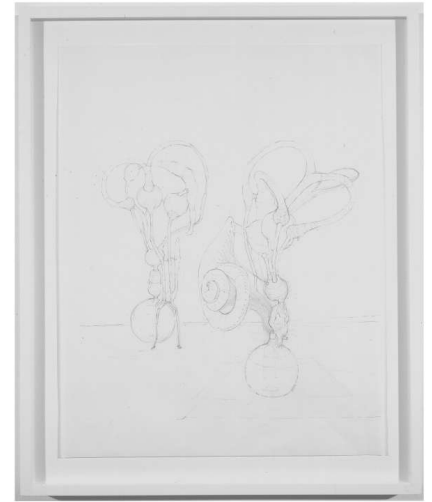
Paul Etienne Lincoln, Membranous Labyrinth Gland Study II, III, IV, 1999 14 x 11 in/35.5 x 28 cm PEL-99-DR-005